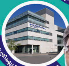
ആശുപത്രികളും നഴ്സിംഗ് ഹോമുകളും